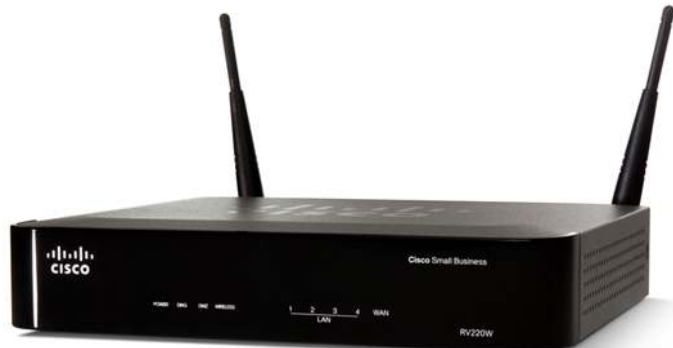
Figure 1. Cisco RV220W Network Security Firewall

To help further safeguard your network and data, the Cisco RV220W includes business-class security features and optional cloud-based Web filtering. Setup is simple, using a browser-based configuration utility and wizards.